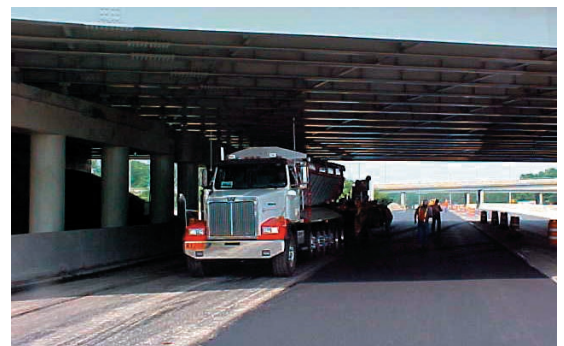
Save time unloading under obstacles.